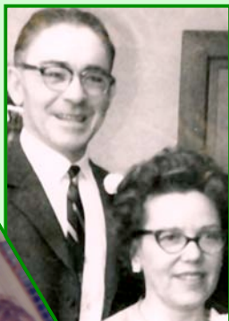
Dad and Mom